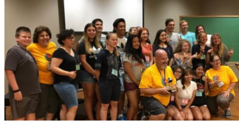
Below: Central States Rotary Youth Exchange

At Grand Rapids, this past weekend with 400 other Central States Exchange students!