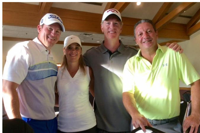
Lowest Score for a Team - with a score of 59, the Rush Oak Park Hospital Team